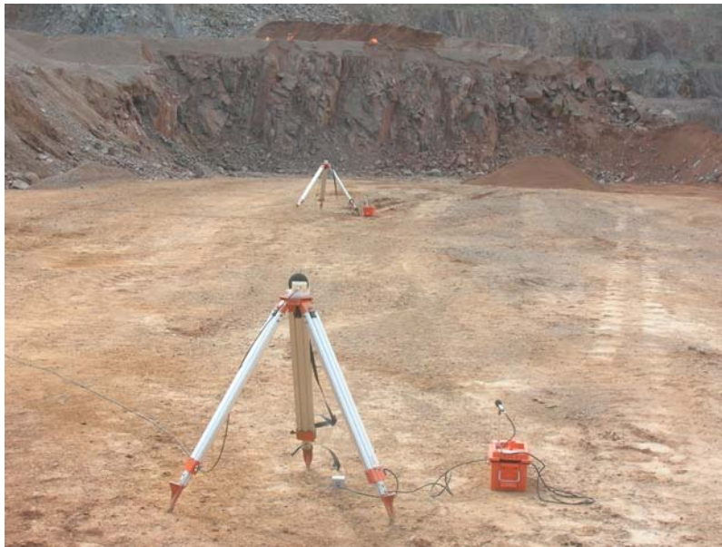
Figure 2 Air overpressure microphones positioned directly in front of the first blast hole.

The primary means of monitoring the air overpressure is via two low frequency response microphones set up at known distances from the blast face. These are placed in a straight line, directly in front of the first blast hole and perpendicular to the face so that the highest possible levels of air overpressure can be recorded.. All four sensors ( face sensor, in hole vibration sensor and two microphones) are linked to a micro trap data logger.