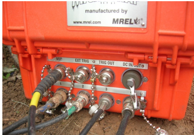
Figure 3 An MREL Microtrap deployed to monitor a blast at Whitwell Quarry

The 'Microtrap' is triggered by a VOD probe cable. The free end of the cable is strapped onto the primer charge containing the detonator so that as soon as the hole detonates, the Microtrap records the entire blast and enables precise arrival times of shockwaves and air overpressure to be recorded.