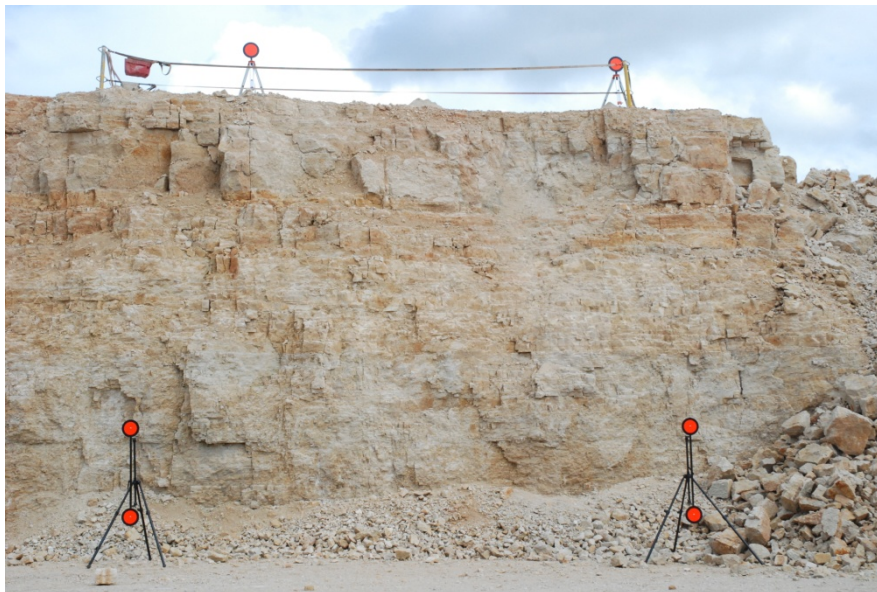
Figure 3 Blast Metrix setup

In order to measure the exact burden in front of the blast holes (the first hole in particular) a face profiling package known as Blast Metrix is used. This is an innovative system which is used for bench face surveying based on three dimensional images. The system involves placing two scaling rods, fixed with targets at the foot of the face and two smaller delimiter targets on top of the bench (see figure 3). Two digital photographs are taken of the face which are processed by the accompanying software package which then generates a three dimensional model of the face (an example in figure 4)