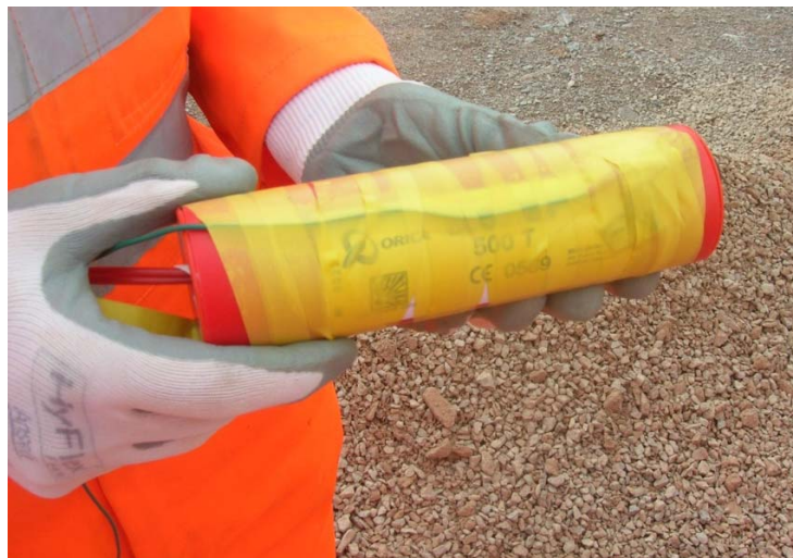
Figure 4 VOD cable strapped to a primer charge

The 'Microtrap' is triggered by a VOD probe cable. The free end of the cable is strapped onto the primer charge containing the detonator so that as soon as the hole detonates, the Microtrap records the entire blast and enables precise arrival times of shockwaves and air overpressure to be recorded.